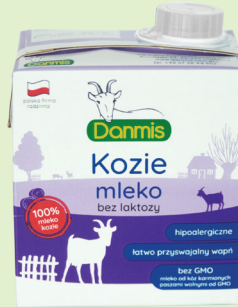
Milk without lactose 500 ml Mleko bez laktozy, Безлактозное молоко, Leche sin lactosa, Laktosefreie Milch