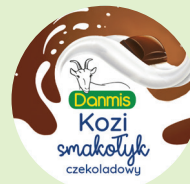
Chocolate tidbit 100 g Kozi smakołyk czekoladowy