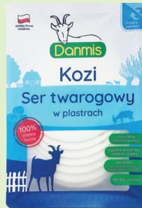
Fresh cheese in slices 150 g Twarogowy w plastrach, Ломтики творога, Queso fresco en lonchas, Frischkäse Scheiben