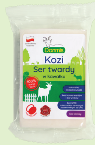
Hard cheese pieces 150 g Ser twardy kawałki, Кусочки твердого сыра, Tacos de queso duro, Hartkäsestücke