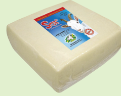
Hard cheese block 10 kg Ser twarogowy blok, Твердый сыр в блоках, Queso duro en bloques, Hartkäse Block