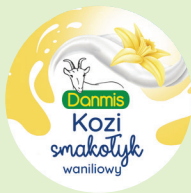
Vanilla tidbit 100 g Kozi smakołyk waniliowy