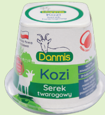
Fresh cream cheese 125 g Serek twarogowy, Сливочный творожный сыр, Crema de queso fresco, Frischkäse