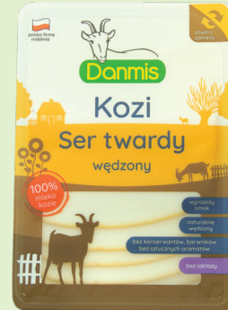
Smoked hard cheese slices 100 g Wędzony ser twardy plastry, Копченый твердый сыр – ломтики, Lonchas de queso duro ahumado, Geräucherte Hartkäsescheiben