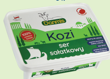
Salad cheese 250 g

Ser sałatkowy, Салатный сыр, Queso tipo mediterráneo, Salat Käse