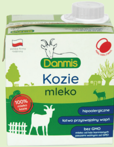
Milk 500 ml Mleko, Молоко, Leche, Milch