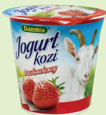
Yoghurt strawberry 125 ml Jogurt truskawkowy, Клубничный йогурт, Yogur de fresa, Erdbeerjoghurt