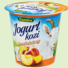
Yoghurt peach 125 ml Jogurt brzoskwiniowy, Персиковый йогурт, Yogur de melocotón, Pfirsichjoghurt