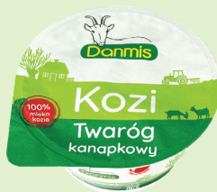
Fresh cheese 150 g Twaróg kanapkowy, Творог, Queso fresco, Frischkäse