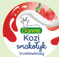
Strawberry tidbit 100 g Kozi smakołyk truskawkowy