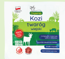
Fresh cheese traditional 200 g Twaróg wiejski, Классический творог, Quark, Quark