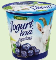
Yoghurt blueberry 125 ml Jogurt jagodowy, Черничный йогурт, Yogur de arándanos, Blaubeerjoghurt