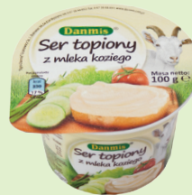
Processed cheese 100 g Serek topiony, Плавный сыр, Queso fundido, Schmelzkäse