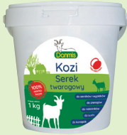
Fresh cheese in bucket 1 kg Twaróg wiaderko, Творог в ведре, Queso fresco en cubo, Frischkäse Eimer