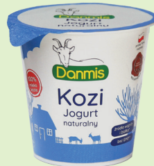
Yoghurt natural 125 ml Jogurt naturalny, Натуральный йогурт, Yogur natural, Naturjoghurt