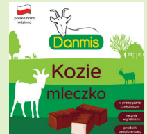
Vanilla marshmallow in chocolate 200 g Kozi mleczko, Ванильная пена в шоколаде, Vanilla mousse en chocolate, Milchschaum in Schokolade