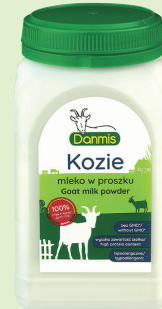
Milk powder 200 g Mleko w proszku, сухое молоко, Leche en polvo, Milchpulver