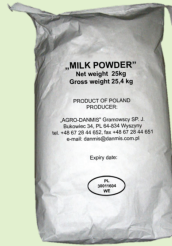
Milk powder sack 25 kg Mleko w proszku worki, Сухое молоко, Leche en polvo en bolsa, Milchpulver Sack